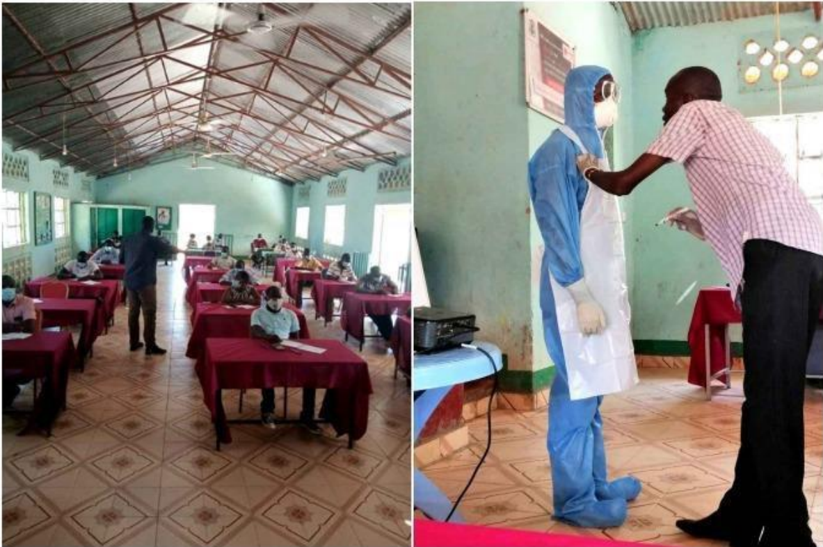
A recent Shalom-SCCRR funded Covid-19 Training at Lodwar for Health Workers (Doctors, Nurses, and other essential personnel), in Turkana County, Northern Kenya. Shalom-SCCRR has been supplying essential equipment and training to medical centers, orphanages in impoverished communities

I couldn't agree more. It is indispensable that personnel and organizations involved in peace and development work (or planning to do so) are up to performing what the effort calls for as well as being authentic in their commitments. Their motivations and interventions should neither get short-changed by parasitic inclinations and/or abuse of the interventions to the disadvantages of African people. Shalom-SCCRR esteems itself on the pledge of its personnel to the letter of the organizational vision, mission and values. Shalom in 2021 continues to deliver while expanding its efforts to counter the spread of Covid-19, particularly in remote poverty stricken rural locations and urban slum settlements. The human and environmental security of Africa is an imperative for the peace and progress of human dignity throughout the whole world.