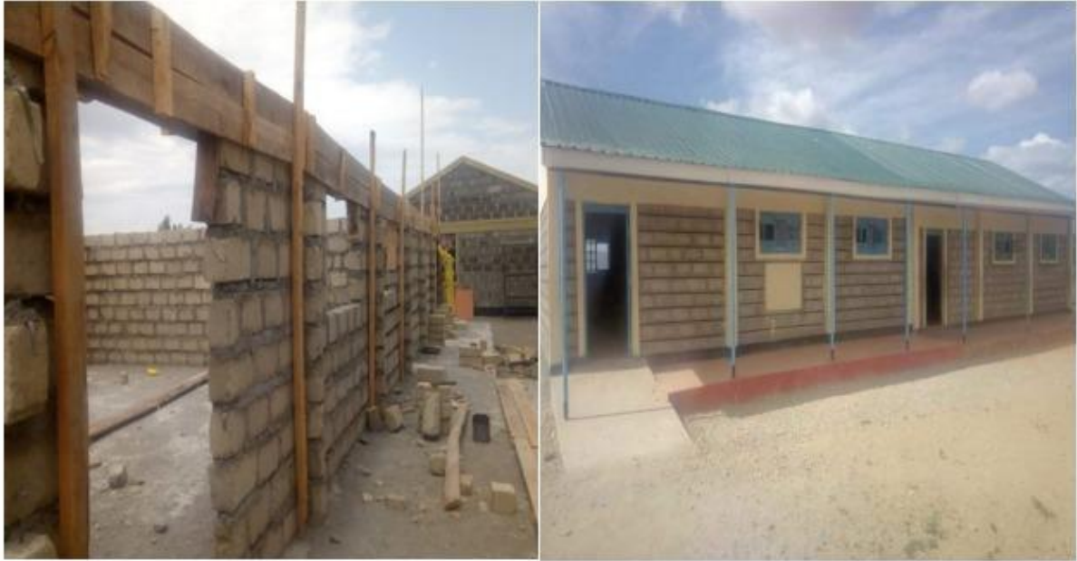
A Shalom - SCCRR's school construction project underway, resulting from peacebuilding interventions in Marsabit County. Shalom is totally committed to inter-ethnic and inter-religious school projects in Eastern Africa