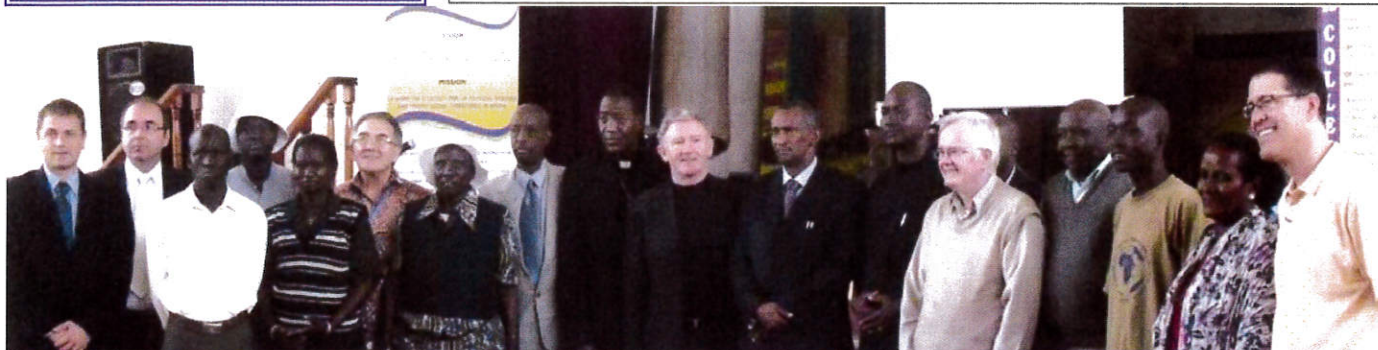
MEMBERS OF THE TURKANA AND SAMBURU COMMUNITIES WITH IGAD AND INVITED GUESTS

The SCCRR is very grateful to all those who took part in this research process. The next step is to bring the findings for evaluation to each of the conflict parties. It is within this framework that local facilitators from both communities, who have received conflict management training from SCCRR will assist the process to develop sustainable peace and development. Following on, both communities comprising of local elders and local influential opinion/policy shapers and government administrators, will come together for joint analysis and agreed plans to ensure peace and mutual wellbeing. The parties to the conflict will be assisted by the SCCRR Team in embracing the painful past, reframing the present, and envisioning their shared future together.