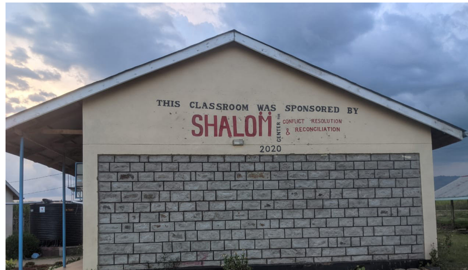
Shalom-SCCRR funded Classroom at Nyang' Primary School in Kisumu/Nandi volatile border, Kenya