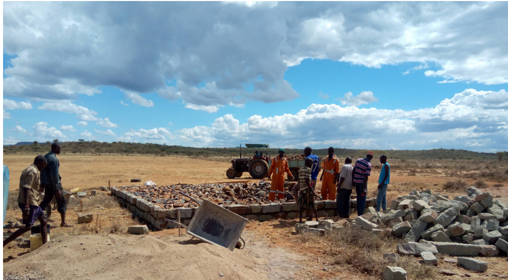
Schools Structures: Construction of Classrooms, Kitchen facilities, Live-in /Boarding facilities, standard Toilets etc.

21,210 boys and girls benefited from Shalom-SCCRR projects