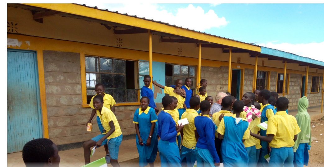
Marti Primary School, Samburu: Shalom Peace Club Members after a Workshop facilitated by Shalom-SCCRR team