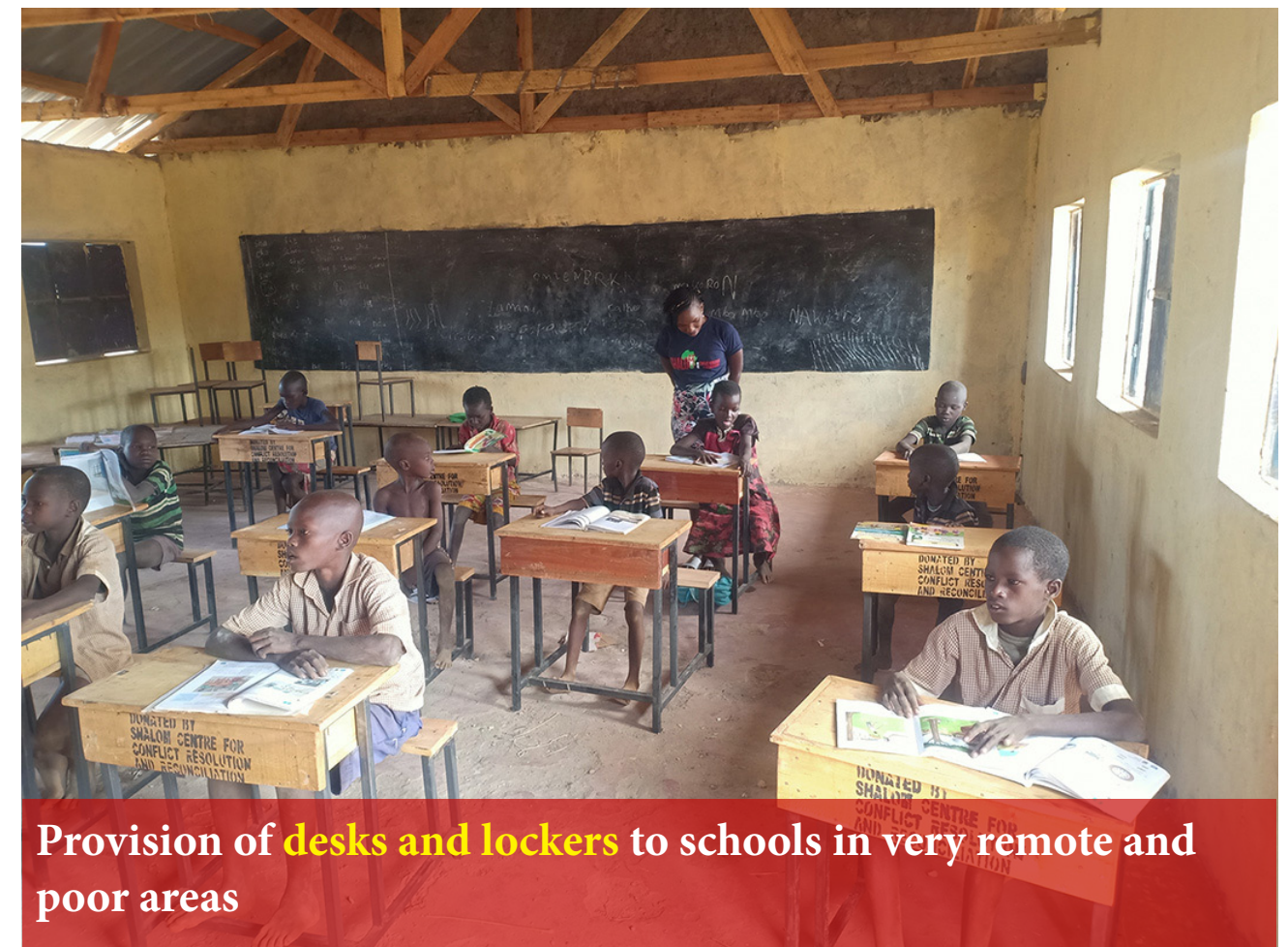
Provision of desks and lockers to schools in very remote and poor areas