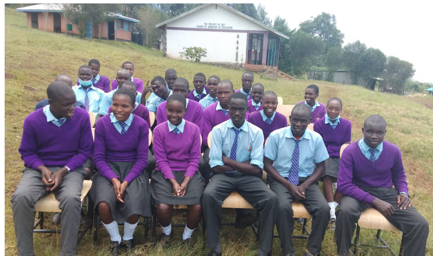
St Peter's Soba Secondary School, Shalom Peace Club Members, Nandi County