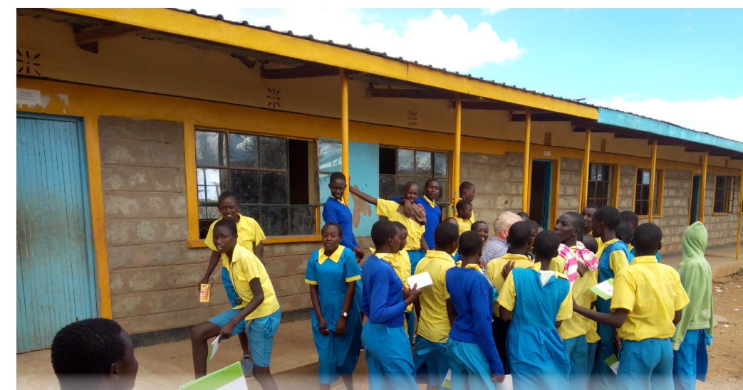
Marti Primary School, Samburu: Shalom Peace Club Members after a Workshop facilitated by Shalom-SCCRR team