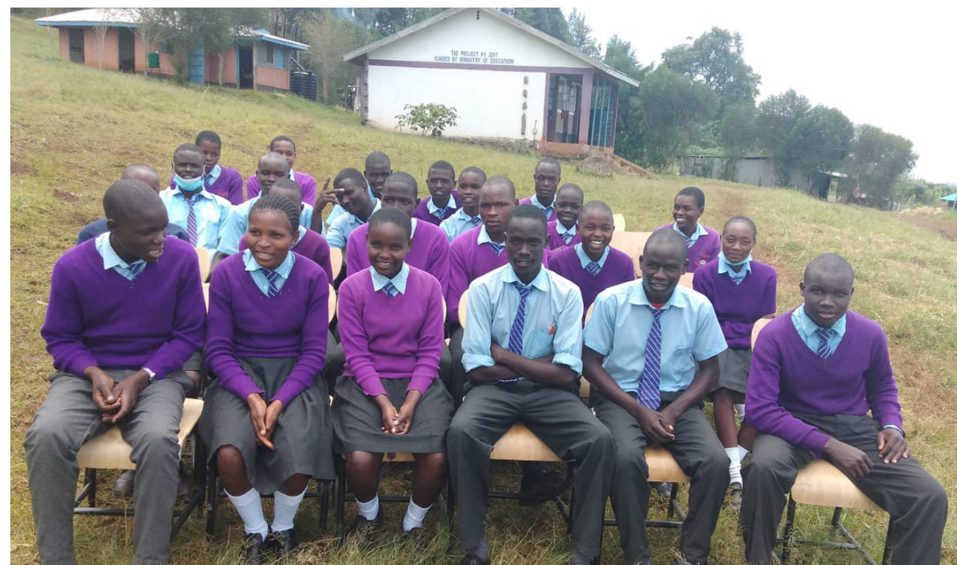
St Peters Soba Secondary School, Shalom Peace Club Members, Nandi County