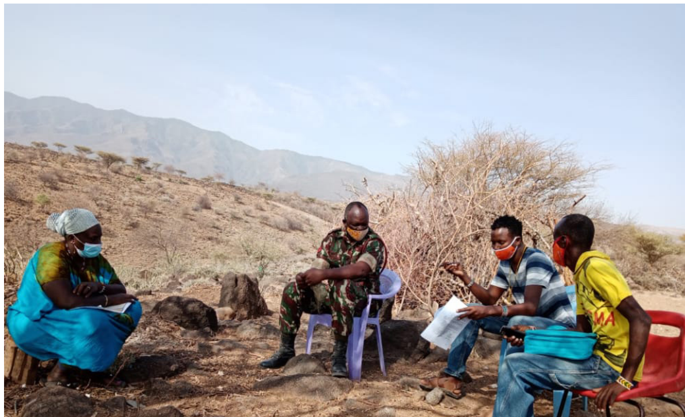
Some local-based 'Conflict Early Warning & Early Response' committee members, trained by Shalom-SCCRR, active in a conflict environment near Arapal in Marsabit County