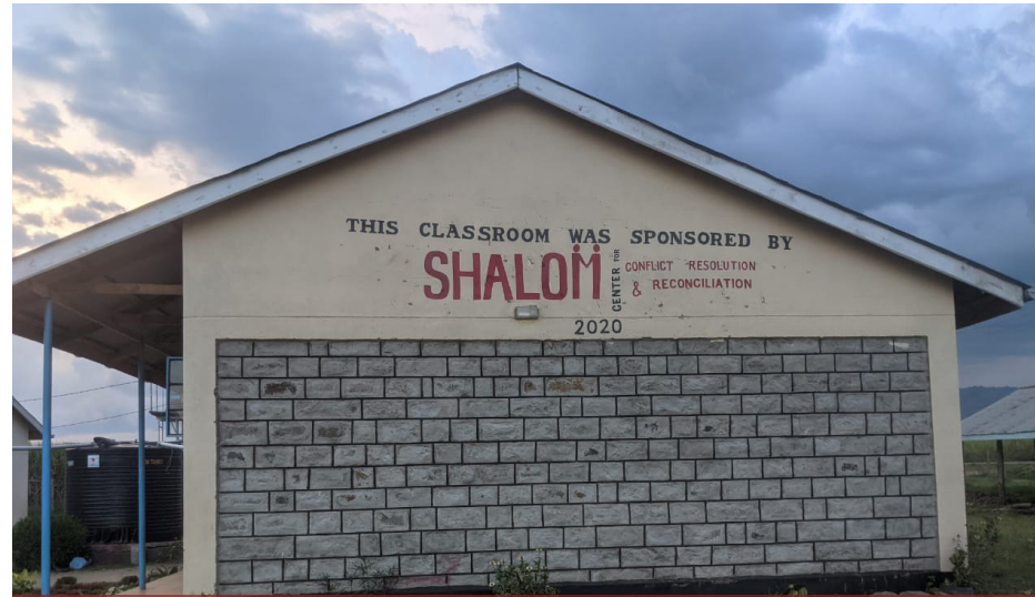
Shalom-SCCRR funded Classroom at Nyang' Primary School in Kisumu/Nandi volatile border, Kenya