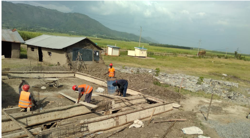
Schools Structures: Construction of Classrooms, Kitchen facilities, Live-in /Boarding facilities, standard Toilets etc.

21,210 boys and girls benefited from Shalom-SCCRR projects