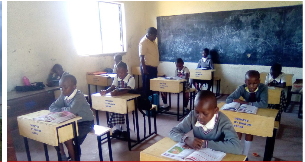
Shalom-SCCRR provision of Desks, Lockers and Text Books at All Saints Education Center, Kainuk, in Turkana County, Kenya

62 Shalom-SCCRR funded School/educational development projects completed in schools/ learning institutions located in the marginalized and conflict environments.