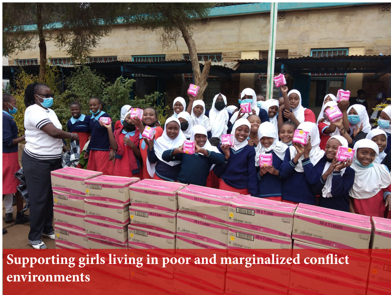
Supporting girls living in poor and marginalized conflict environments