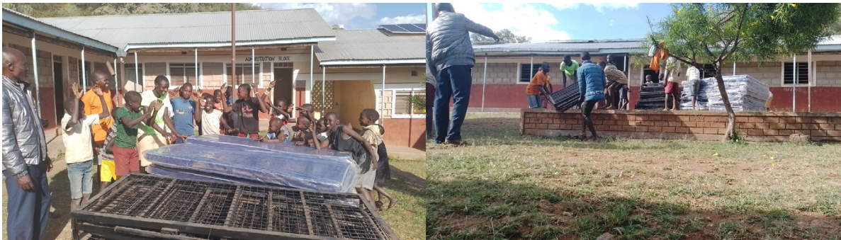
Shalom-SCRR logistics team Delivering Beds, Mattresses and other live-in items to Sasak Primary School in West Pokot, northern Kenya. This support will help these pupils to board in the school thus enhancing their focus to studies. Their focus to learning has often times been hampered by livestock herding duties assigned to them and also by the nomadic lifestyle of the herders of moving place to place in search of pasture and water.