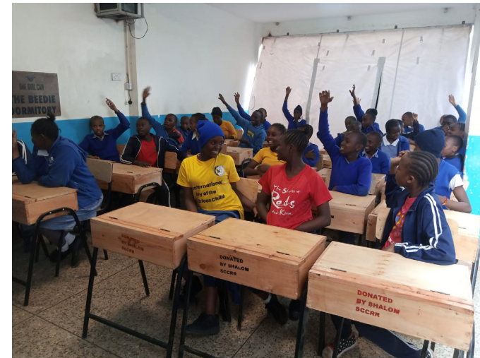
A delivery of lockers at Ushirika School Center located in Kibera informal settlements (slums) in Nairobi, Kenya.