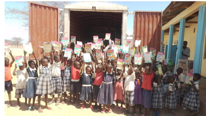
St. Peter's Lorgum pupils in Turkana County, northern Kenya, receiving books and other learning materials.