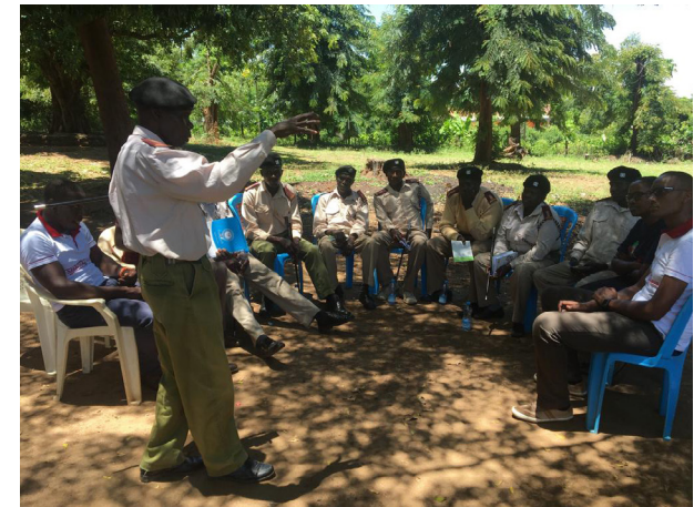
Shalom-SCRR Monitoring, Evaluation, Research & Learning and Project Implementation teams, conducting a consultative forum with local government administrators in the conflict-prone Kerio Valley, northern Kenya. The forum aimed at identifying best strategies for conflict transformation/peacebuilding and sustainable development.