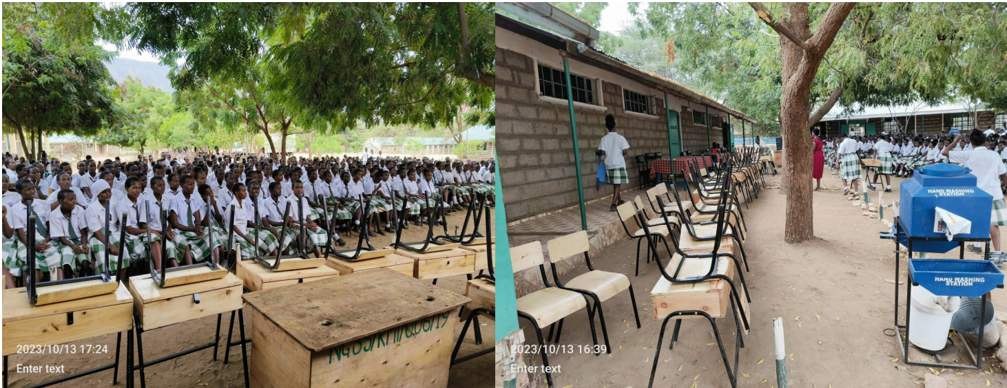
A delivery of lockers and other items to Nyiro Girls Secondary school, in Samburu County, northern Kenya. This support is meant to enhance the comfort of learners, provide safe space for storage of books and other learning materials.