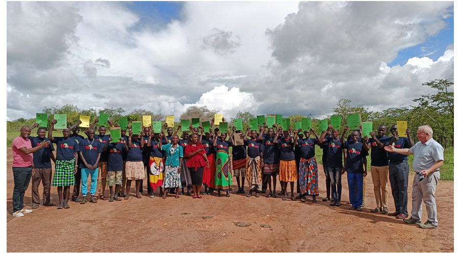
Shalom-SCRR Team with Shalom trained local peace actors along the Turkana/West Pokot borderline, Kenya, celebrating a successful Peacebuilding intervention . These empowered Peace actors will continue implementing peace work by applying knowledge, skills and techniques imparted by Shalom-SCRR.