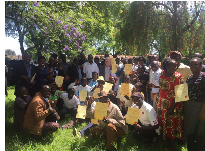
Shalom-SCRR team and Shalom empowered Peace actors celebrating a successful Peacebuilding intervention along the Kisumu-Nandi border in Muhoroni-Tinderet settlement areas. These empowered local peace actors will carry on peace work in the absence of Shalom. Shalom will remain a friend and mentor – ever available to support the communities on their path to peace if need be