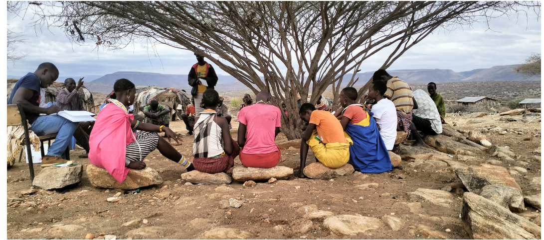
Conflict Transformation, Peacebuilding and Development Interventions