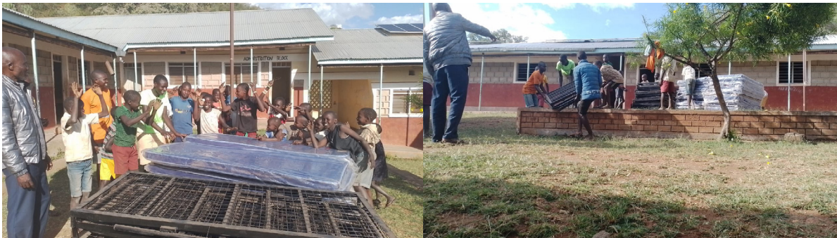
Shalom-SCRR logistics team Delivering Beds, Mattresses and other live-in items to Sasak Primary School in West Pokot, northern Kenya. This support will help these pupils to board in the school thus enhancing their focus to studies. Their focus to learning has often times been hampered by livestock herding duties assigned to them and also by the nomadic lifestyle of the herders of moving place to place in search of pasture and water.