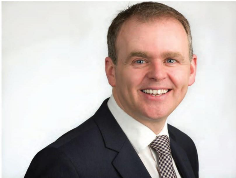
Joe McHugh, Irish Government Minister for Overseas Development

“This was an opportunity for us as a country to give our ongoing commitment to many of the crisis that there are, especially in the Horn of Africa. It was also an opportunity for me to acknowledge the host countries in the Horn of Africa who deal with large numbers of refugees. But on top of that we were focused on our sustainable development goals. We are very focused on – in line with António Guterres (UN Secretary General) as well – at how we can look at and examine the root causes; looking at peace and reconciliation; to looking at how we can bring peace which will obviously lead to sustainable development. We can’t have sustainable development without peace.