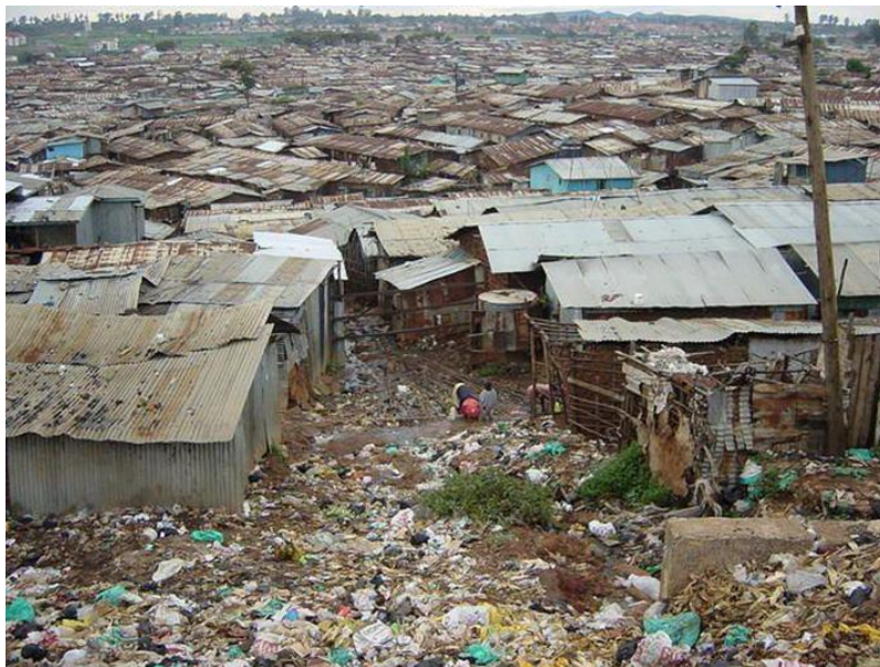
An Ariel view of Kibera slums; one of Nairobi's informal settlements where Shalom-SCRR works

Shalom's staff not only have postgraduate qualifications that befit the theoretical and practical demands of peacebuilding but also possess practiced skills in building trust between antagonistic