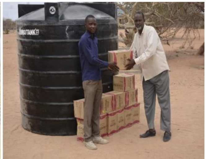
Shalom-SCCRR is continuously making a difference in marginalized inter-ethnic and inter-religious conflict environs in Eastern Africa. Through education, peace and development can be achieved. Marodhile primary school in North Eastern Kenya has received educational and development assistance from Shalom-SCCRR

We have been particularly active in the Kenya border areas near Ethiopia, South Sudan, Somalia, and Uganda. These locations experience manifest inter-tribal conflict and marginalization violence, recurrently heightened by nomadic pastoralist lifestyle's that necessitates movement over official borders and unofficial boundaries for survival. It is in these areas that Shalom's investment is key, working with 16 ethnic groups, conducting workshops and implementing development projects aimed at helping to end the cycles of violence.