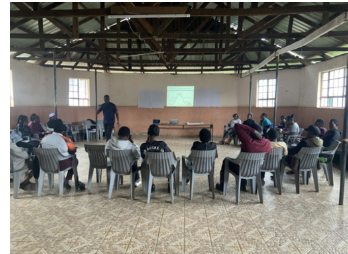
Economic hardship and limited job opportunities, particularly among youth in urban slums, create a fertile ground for radicalization into extremist ideologies and criminal gangs. The Shalom-SCCRR team of professionals actively works with the youth and key stakeholders to address this pressing issue.