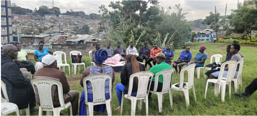
A Shalom-SCCRR facilitated Training Workshop conducted in Mathare Slums. Urban informal settlements and Slums in Nairobi face a variety of conflict issues rooted in social, economic, and political inequalities. These conflicts are often exacerbated by rapid urbanization, inadequate service delivery, and systemic marginalization of informal settlements.