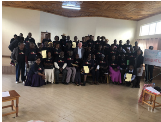
Graduation ceremony of Shalom-trained Peace Actors in Nakuru County, Kenya. These empowered individuals serve as key pillars of peacebuilding in the Molo and Kuresoi areas in Nakuru County, Kenya, which were deeply impacted by post-election violence particularly in 2007/2008.