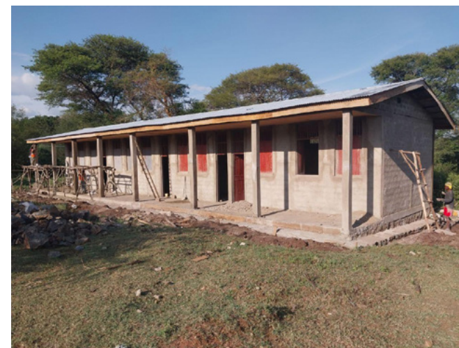
Demecki Primary School in Ethiopia. Shalom-SCCRR funded the construction of classrooms. The school is located in the volatile Ilemi Triangle at the Kenya-Ethiopia border. Shalom-SCCRR is implementing Conflict Transformation and Peacebuilding intervention that engages the Turkana and Dassanech ethnic communities.