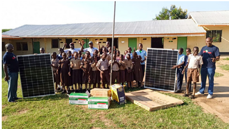
Shalom-SCCRR Team delivered Solar System Accessories to St. Benedict School of Peace Aror in Elgeyo Marakwet County, northern Kenya. Communities in this area known as Kerio Valley, "the Valley of Death", have suffered from deadly inter-ethnic violence, resulting in deaths, crippling injuries, destruction of livelihoods and displacement. Shalom interventions in the area comprise Conflict Transformation and Peacebuilding, and School Educational Development Projects.