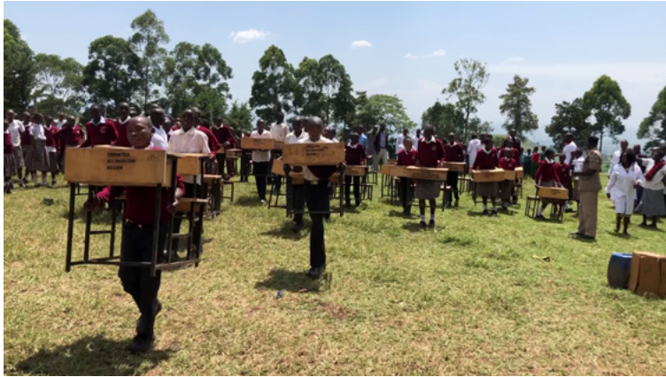
We delivered pupils' desks and teachers' office tables to Mombwo Comprehensive School in Nandi County, Kenya. This support is meant to enhance the comfort of learners and provide safe storage for books and other learning materials.