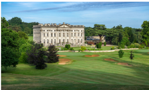
Moor Park Golf Club