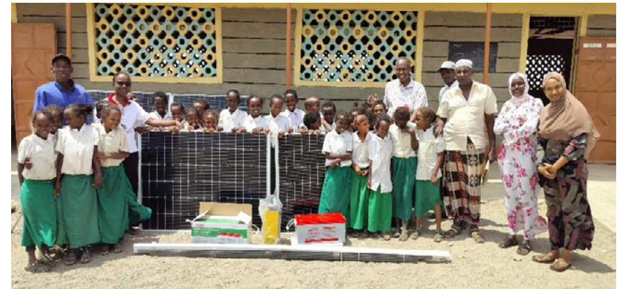
Shalom-SCCRR team delivering Solar System installation in one of the marginalized schools in Marsabit, northern Kenya. Shalom-SCCRR funded the Installation to provide lighting for both the pupils and the school administration.