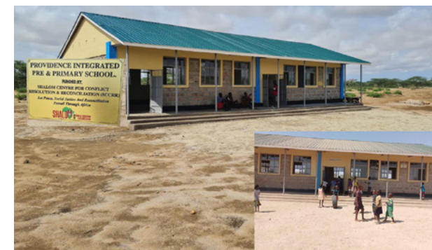
Shalom-SCCRR funded classrooms constructions at Providence Integrated Pre & Primary School in Turkana County, northern Kenya.