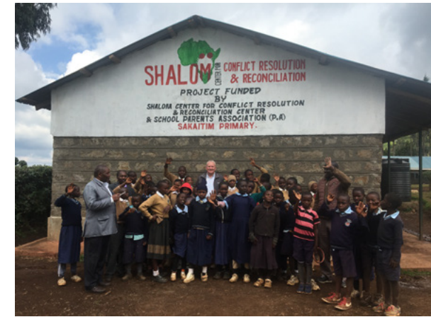
Teachers and learners of Sakaitim Primary School in Nakuru County, Kenya, celebrate completion of a class funded by Shalom-SCCRR. Nakuru is one of the Shalom-SCCRR's conflict transformation and peacebuilding success stories.