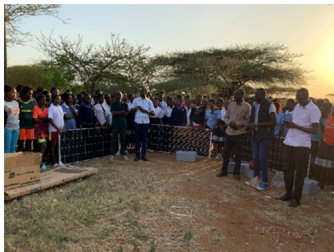
The shalom-SCCRR team delivered solar system accessories to Baragoi Girls Secondary in Samburu County, Kenya. The school has frequently been disrupted by deadly, violent inter-ethnic conflict. Shalom-SCCRR is engaging the communities living in Baragoi in a conflict transformation and peacebuilding intervention.